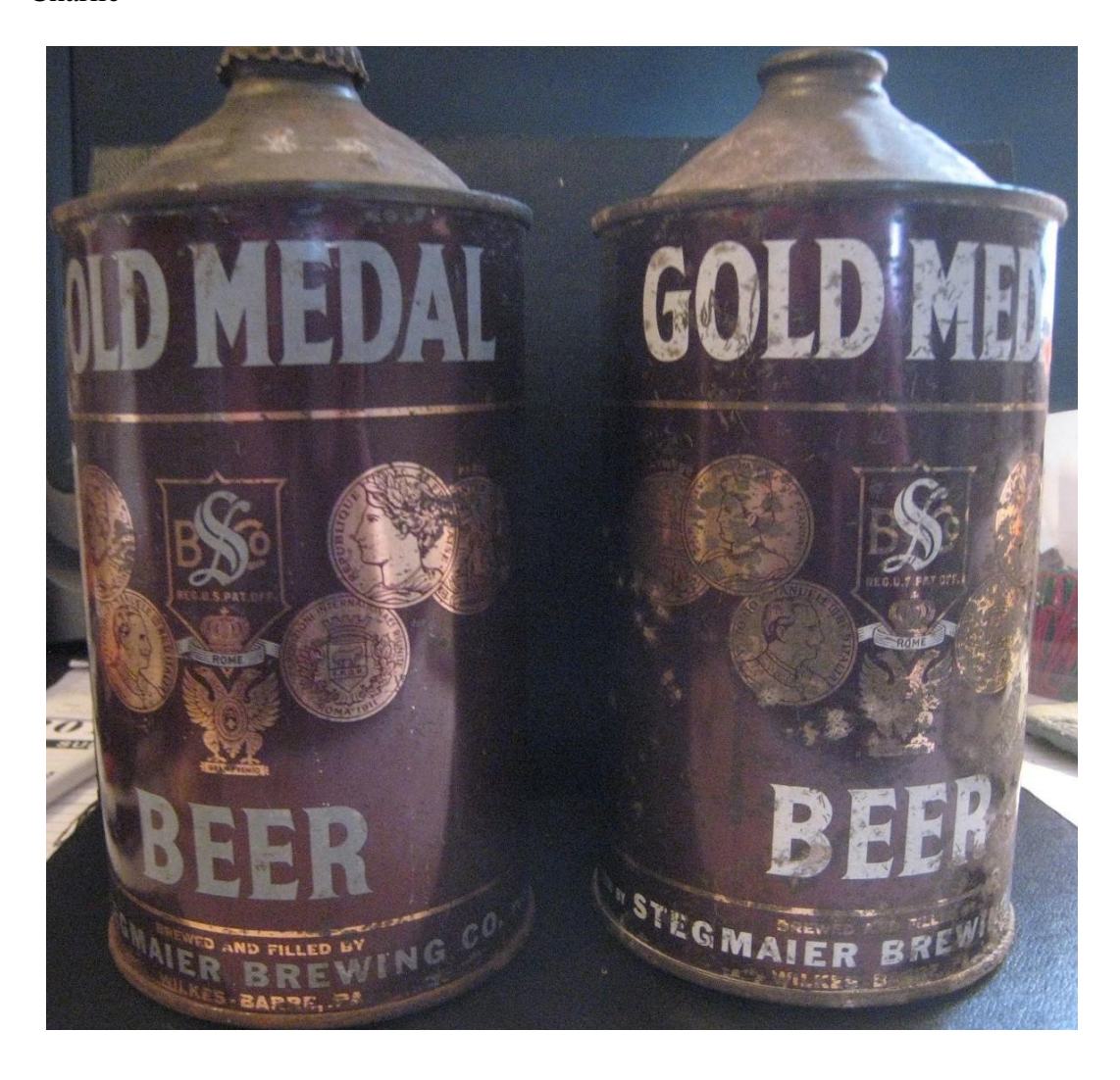
Thanx - Charlie

This is a fairly common quart. Therefore I am asking everyone to check their Stegmaiers. Are there another gray paint Stegmaier quarts out there? Is it a color variation but not a completely different can? Please weigh on with any information or opinion on this quart.